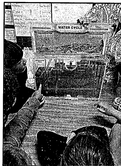
Aquifer model used in Mr. Yang's 2 nd grade class at Hoffer Elementary on 2/5/20